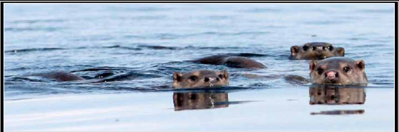
Otters - - June 2014