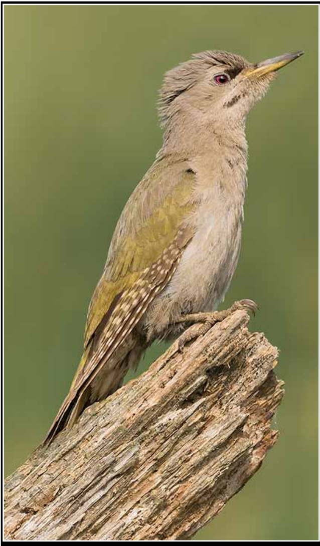
Grey-headed Woodpecker - M. Vigo - June 2014