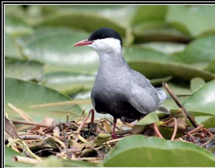
Whiskered Tern - May 2014