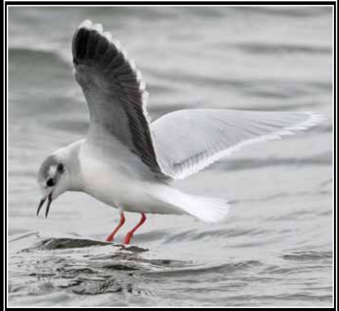
Little Gull - M. Biasoli - June 2014