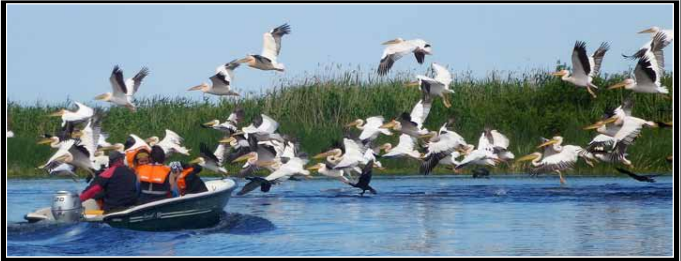
Little Boat & White Pelicans - M. Biasoli - June 2013