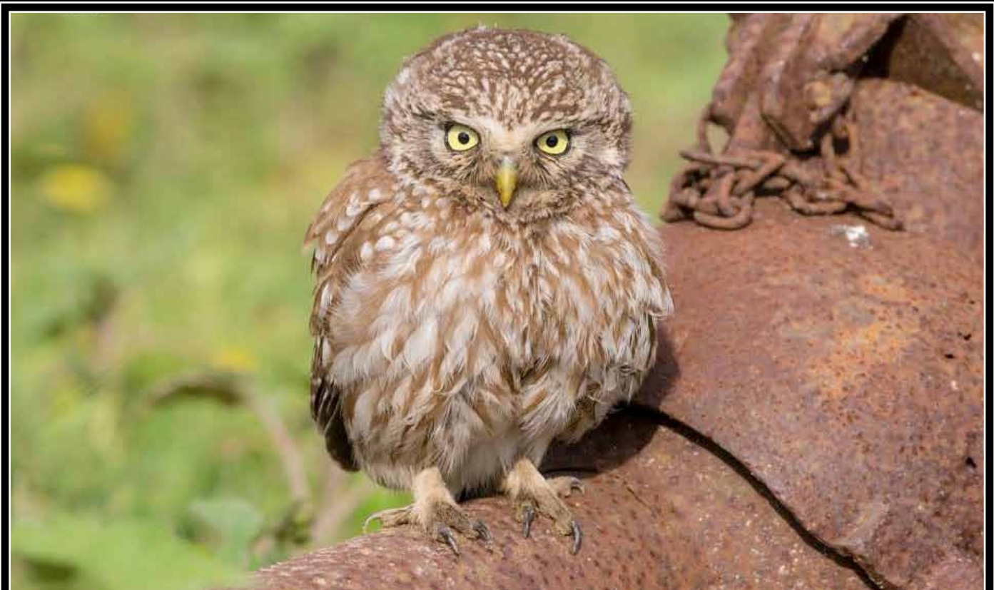
Little Owl - M. Valentini - June 2014