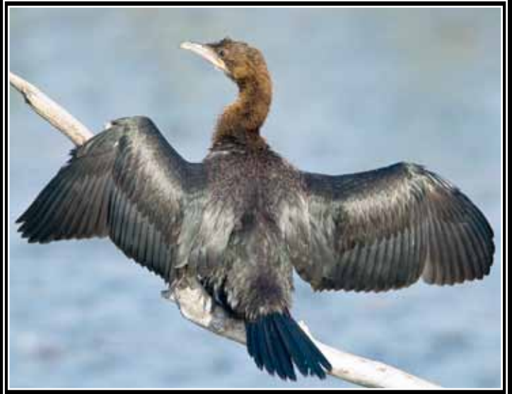
Pigmy Cormorant - V. Fracassi - September 2014