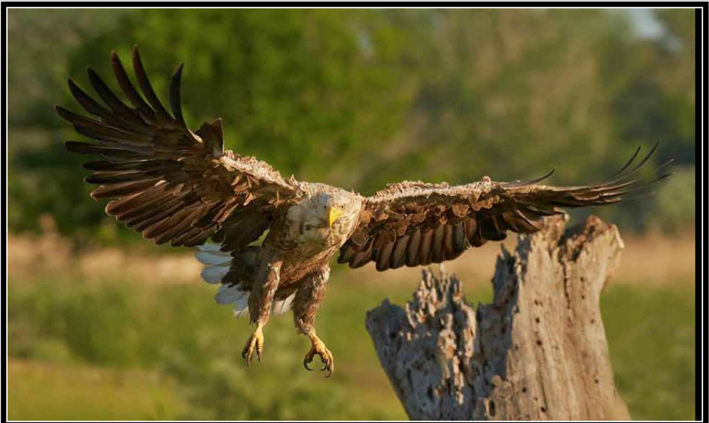
White-tailed Eagle - R. Steel - May 2014