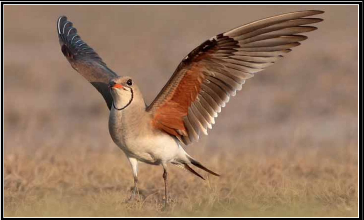
Collared Pratincole - M. Biasioli - June 2014