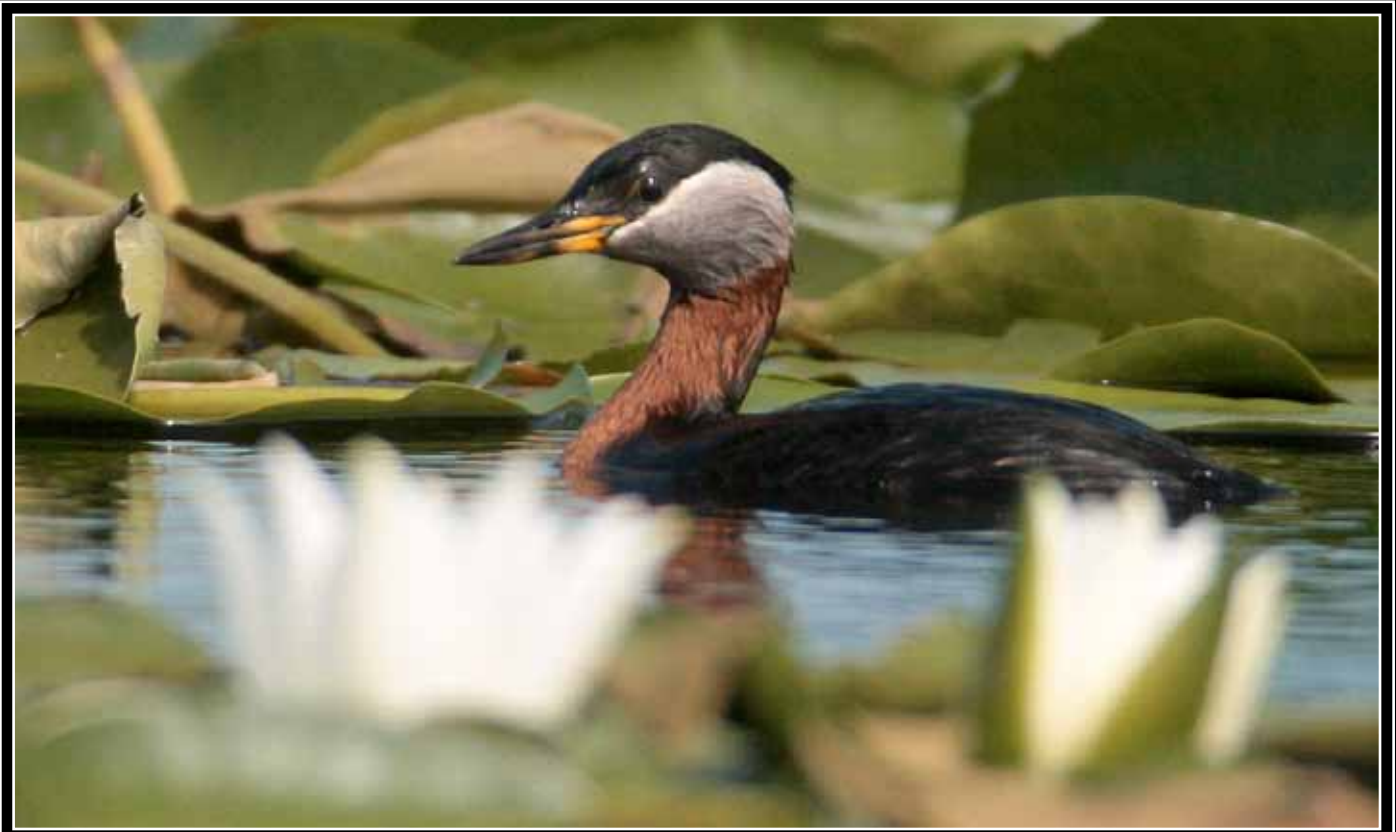
Red-necked Grebe - M. Biasoli - June 2014