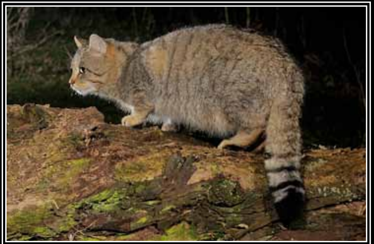
Wild Cat - P. Serrano - February 2013