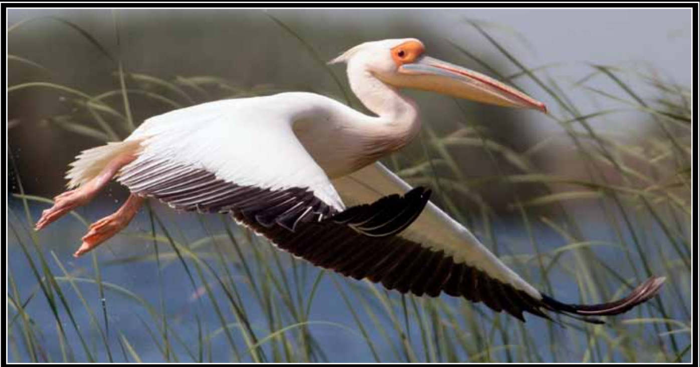
White Pelican - - June 2014