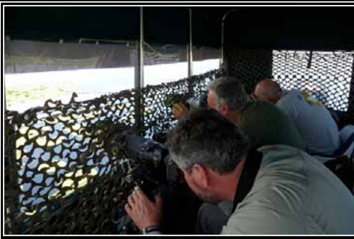
Boat hide