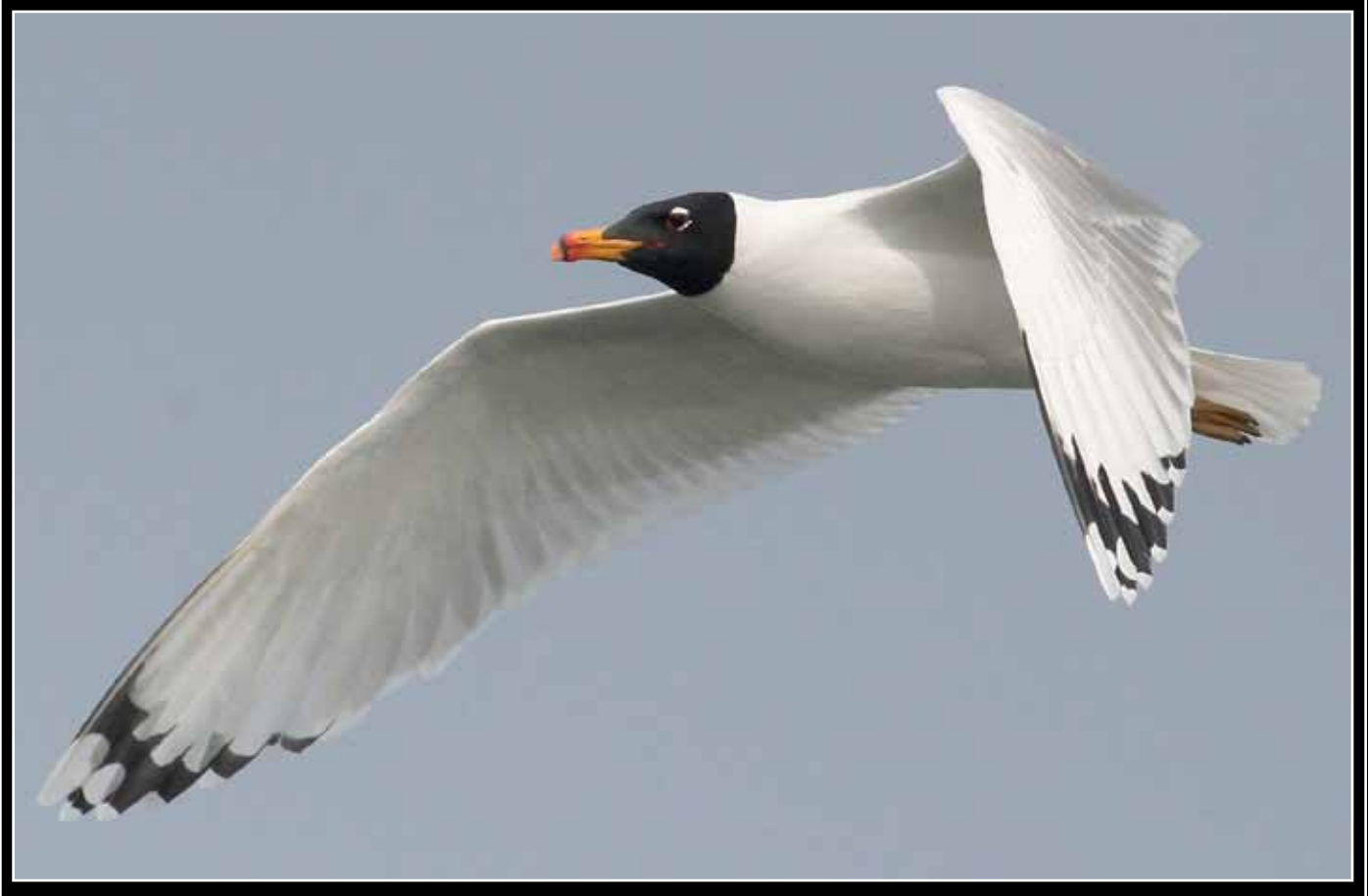
Pallas Gull - M. Biasoli - March 2014