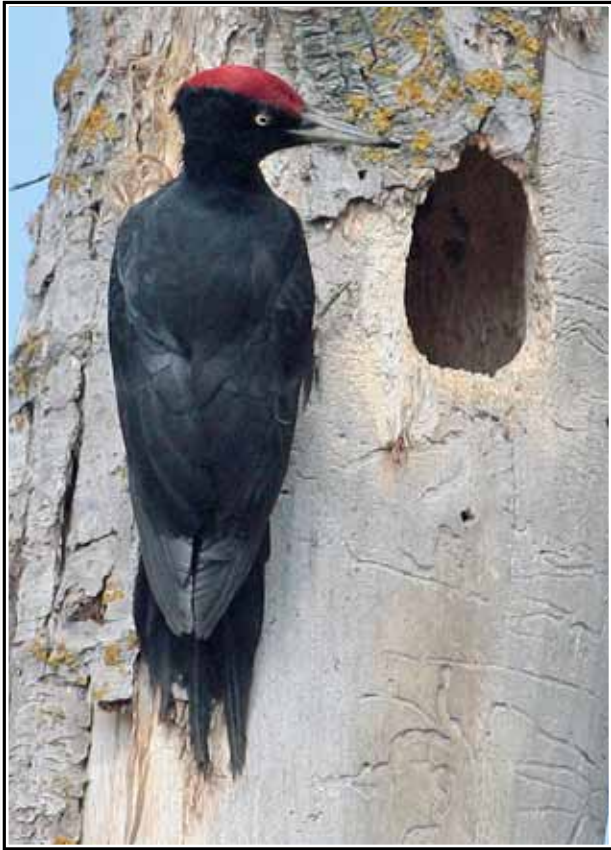
Black Woodpecker - M. Biasoli - March 2014