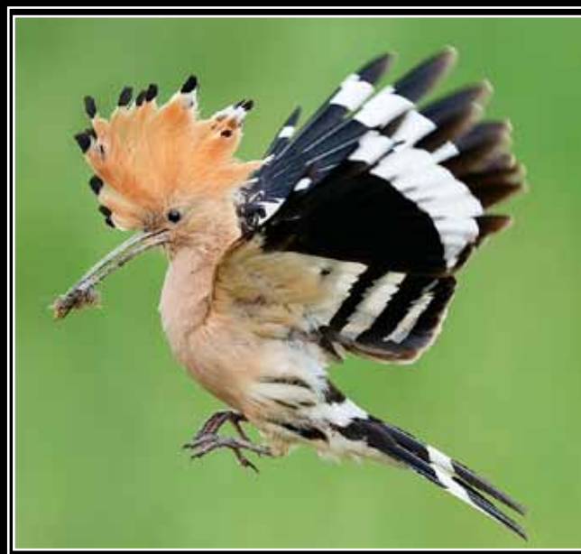
Hoopoe - M. Vigo - June 2014