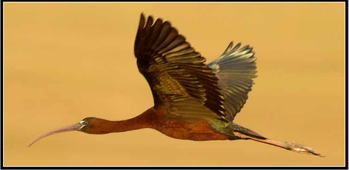
Glossy Ibis - B. Gil - June 2013