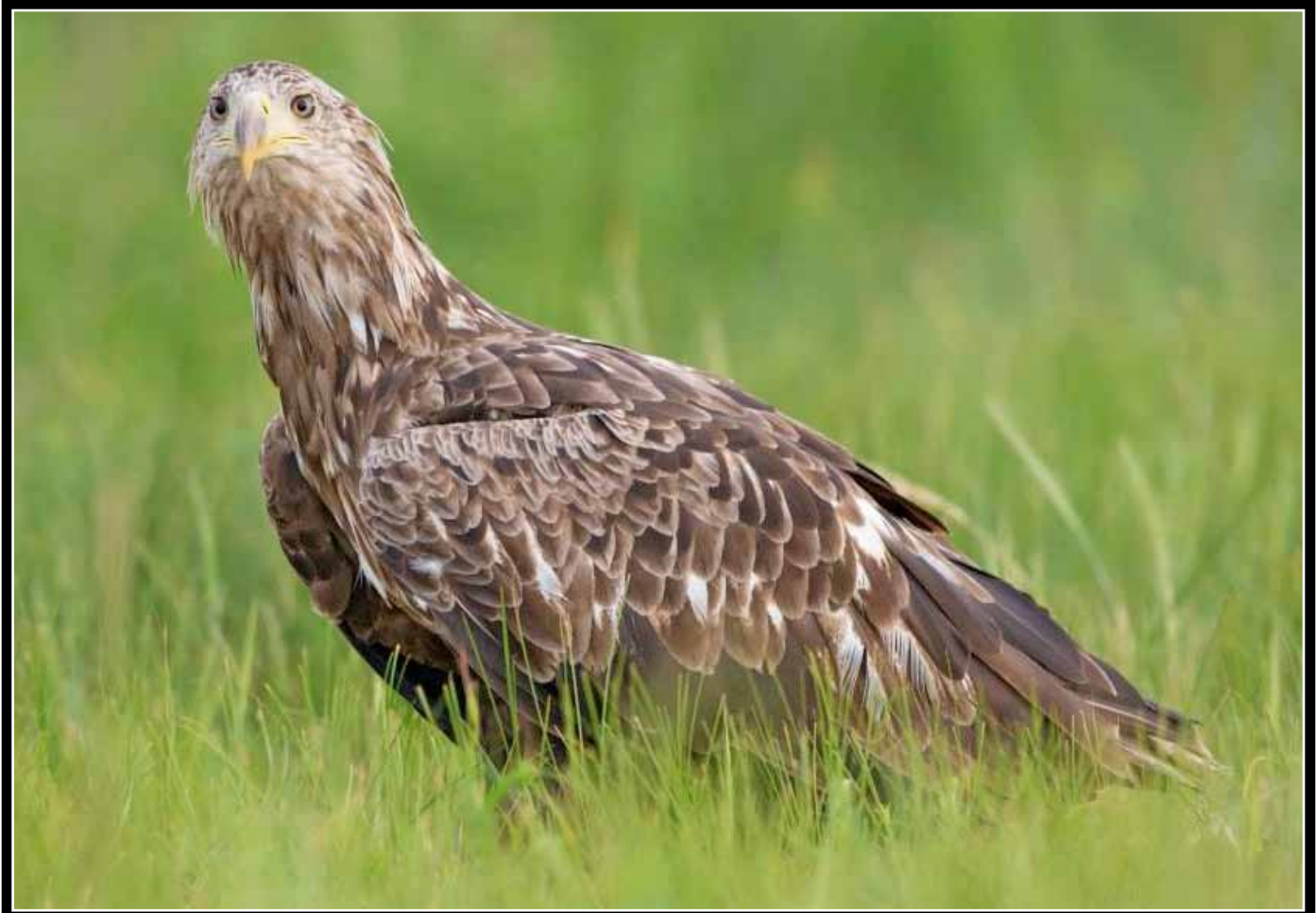
White-tailed Eagle - M. Valentini - June 2014