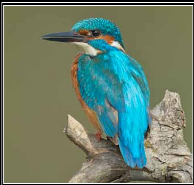
Kingfisher - R. Steel - May 2014