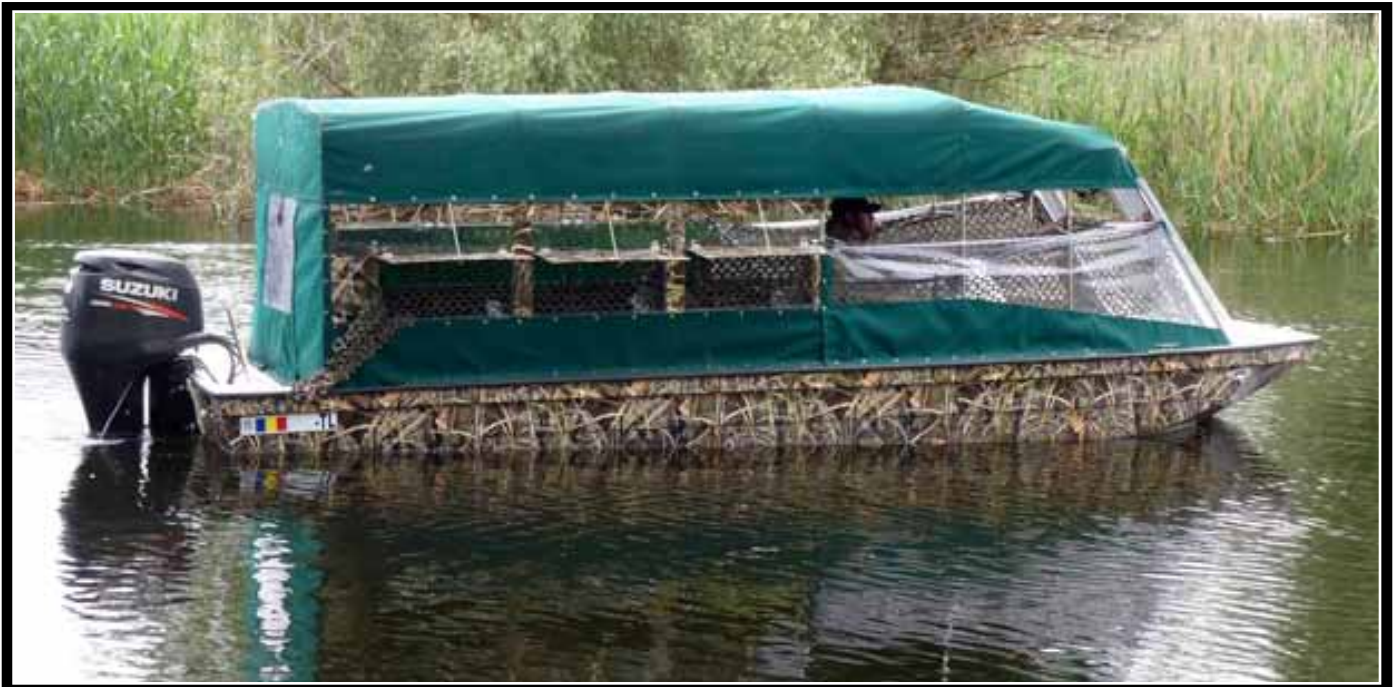
Boat hide - M. Biasoli

A boat especially made to get closer to animals that are possible to find in the internal canals and lakes of the majestic Delta. A low angle and comfortable rotating seats allow to optimise at best shots of different species of pelicans, grebes and terns. The powerful gasoline engine is used to reach strategic places, then the electric engine is turn on to silently proceed and approach species.