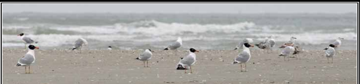
Pallas and Caspian gulls - - March 2014