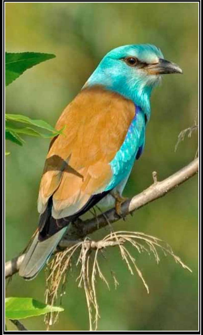
European Roller - L. Zuntini - May 2013