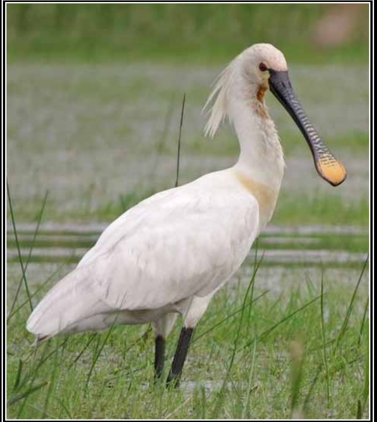
Spoonbill - L. Boscain - May 2014