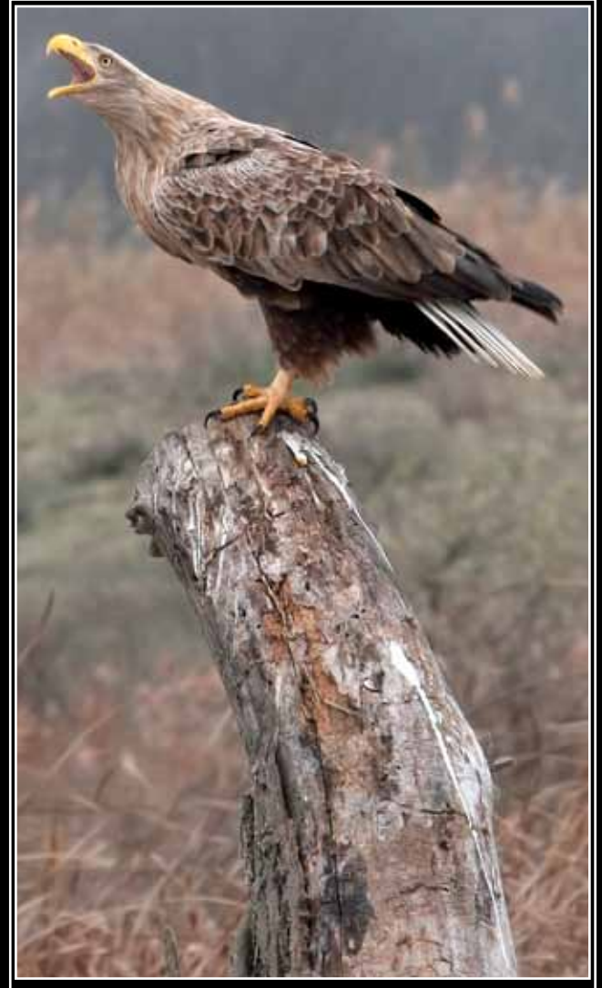
White-tailed Eagle - M. Biasoli - November 2013