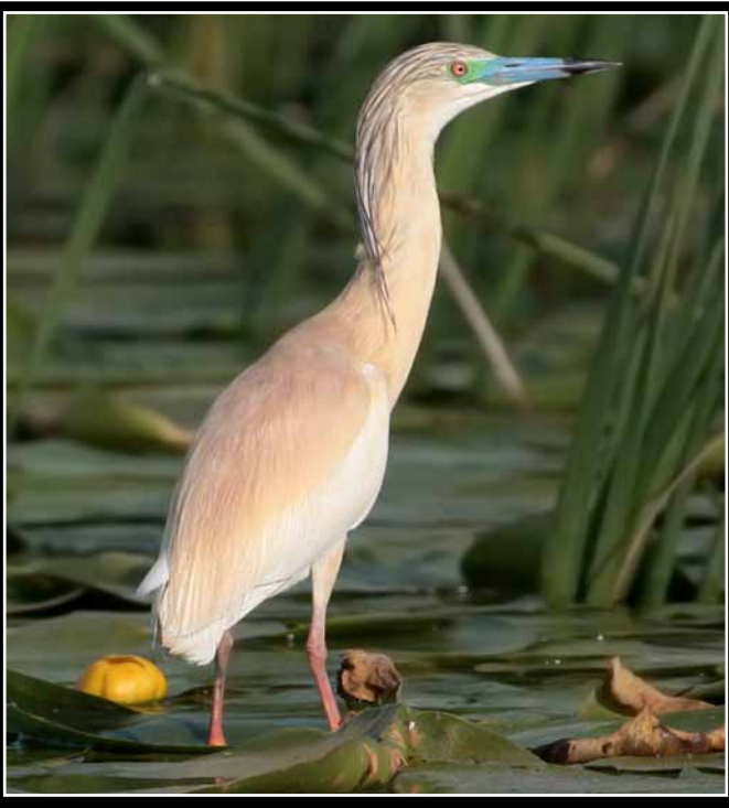
Squacco Heron - June 2014