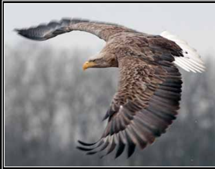
White-tailed Eagle - M. Biasoli - November 2013