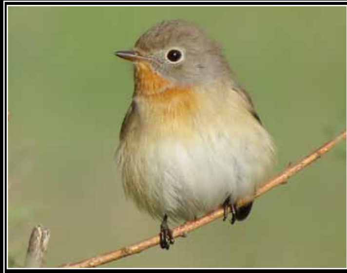
Red-breasted Flycatcher - September 2013