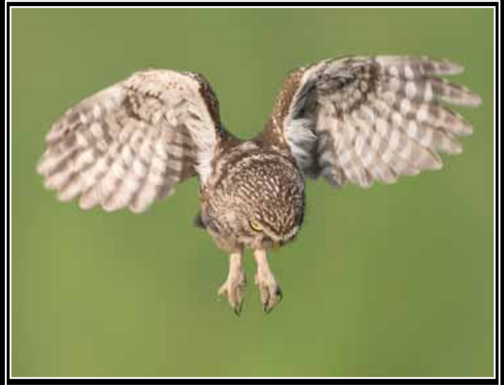
Little Owl - M. Vigo - June 2014