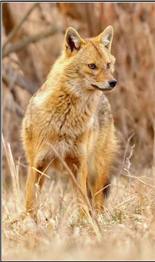
Golden Jackal - - February 2013