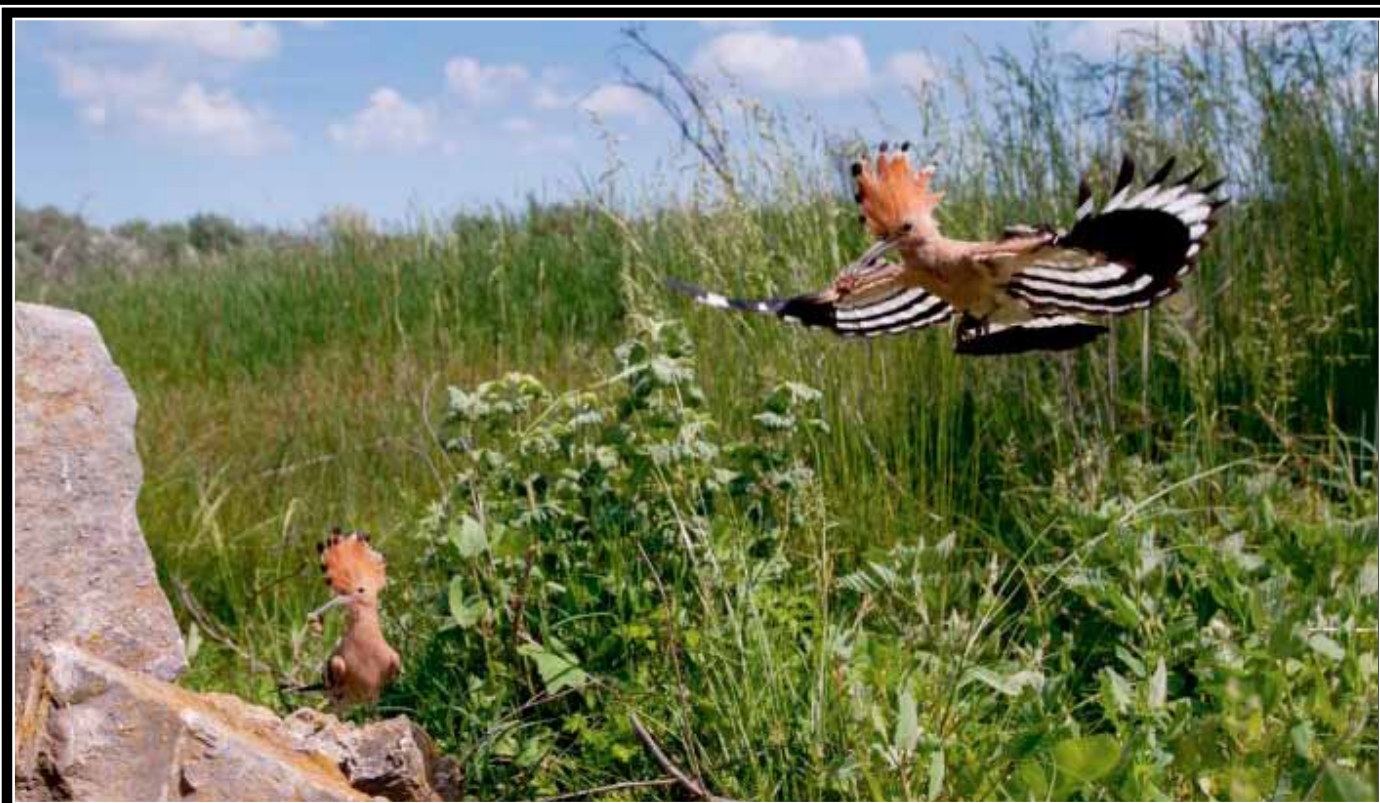
Hoopoe - G. Ghezzi - June 2014