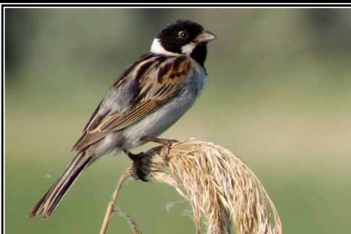
Reed Bunting - L. Boscain - May 2013