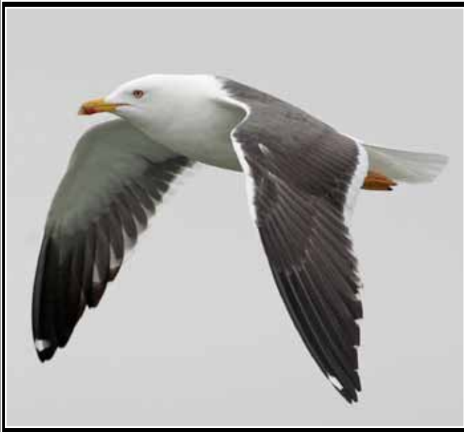
Lesser Black-backed Gull - M. Biasoli - June 2014