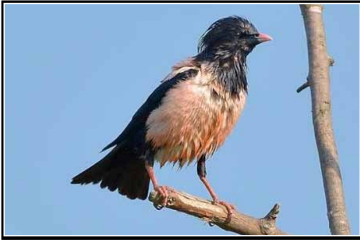
Rosy Starling - T. D'Arcangelo - June 2014