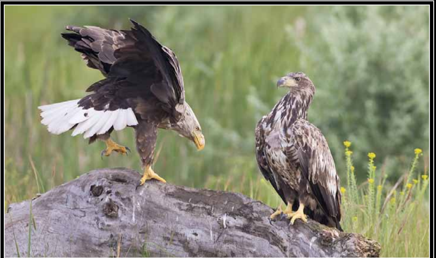
White-tailed Eagle - M. Valentini - June 2014