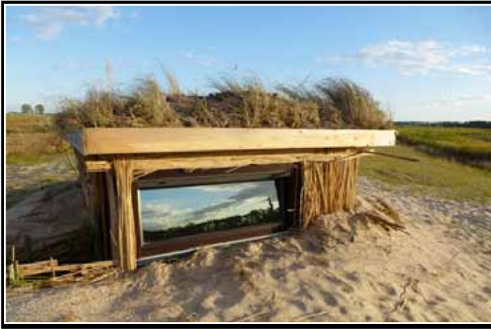
White-tailed Eagle hide - M. Biasoli