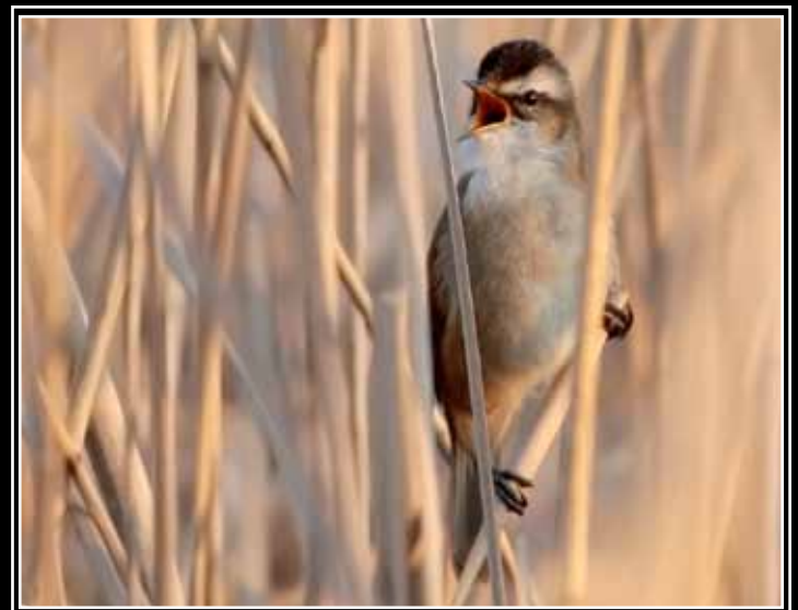
Moustached Warbler - M. Biasoli - March 2014