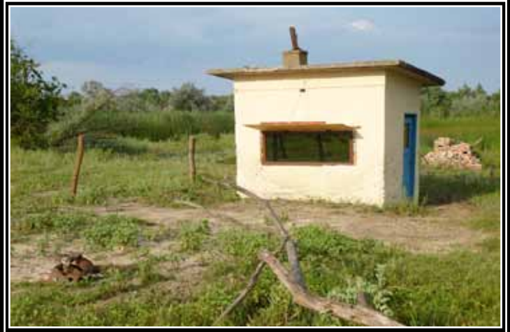
Little Owl hide - M. Biasoli