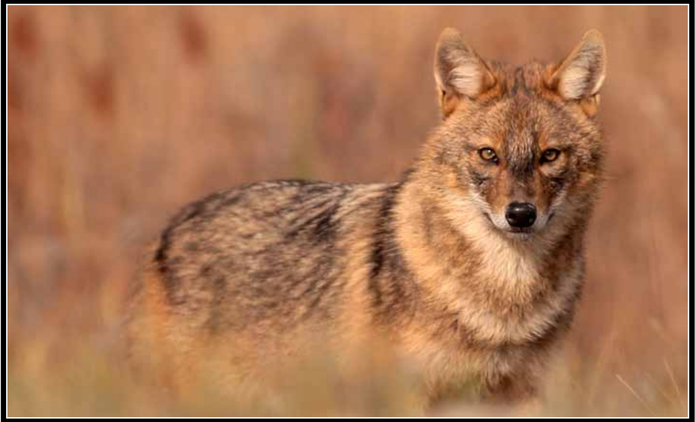
Golden Jackal - - November 2014