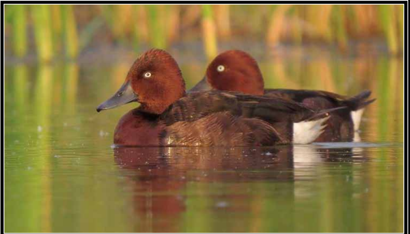
Ferruginous Duck - L. Boscain - May 2014