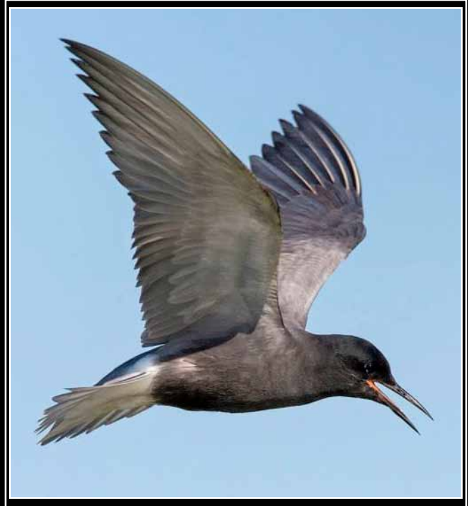
Black Tern - M. Valentini - June 2014