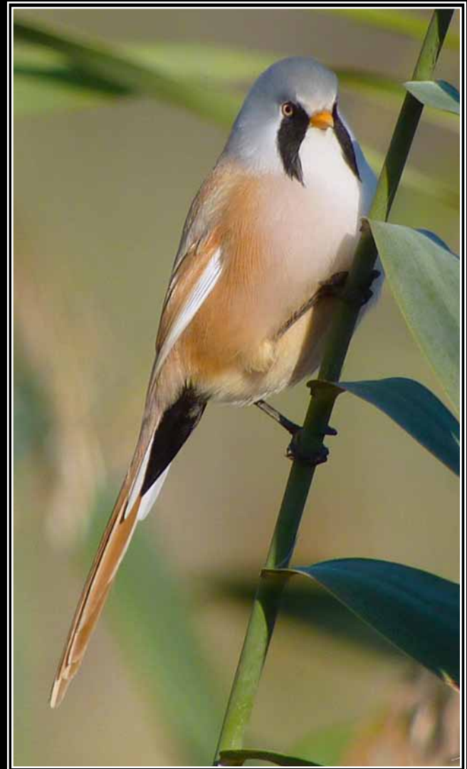
Bearded Reedling - M. Biasioli - September 2013