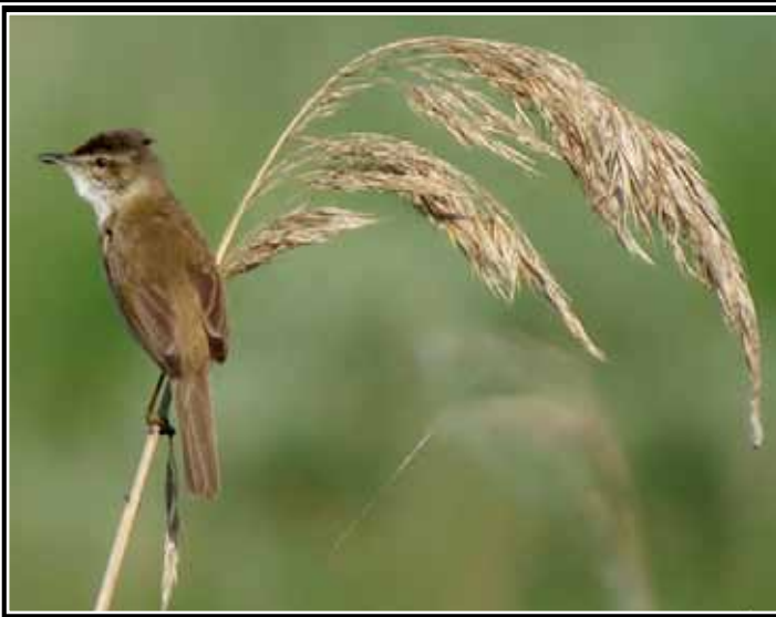
Paddyfield Warbler - L. Boscain - May 2014