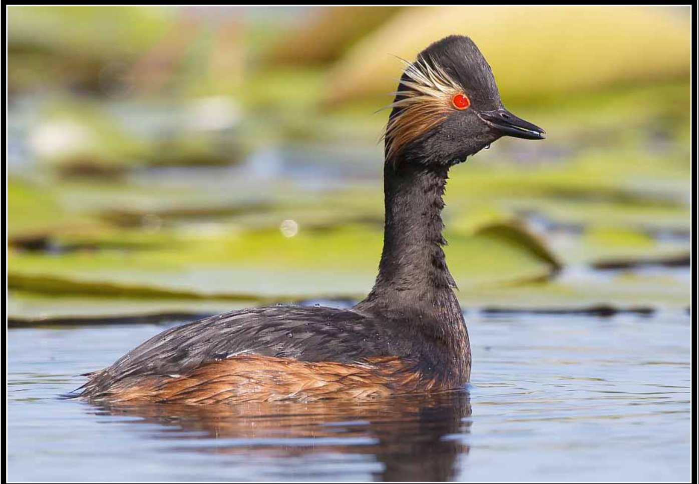
Black-necked Grebe - M. Valentini - June 2014