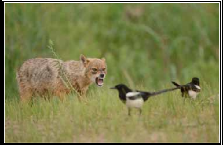
Golden Jackal - - May 2014