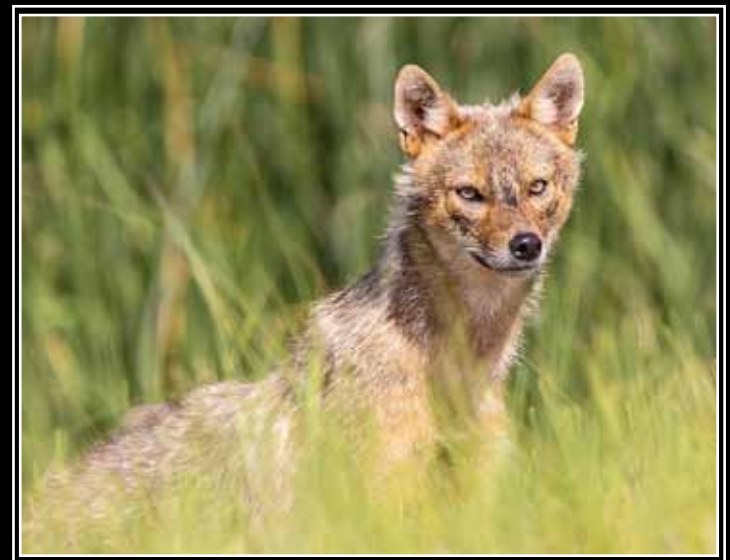
Golden Jackal - - May 2014