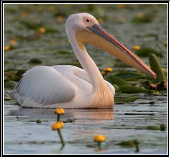
White Pelican - - June 2014