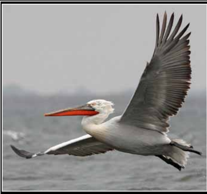
Dalmatian Pelican - - November 2013