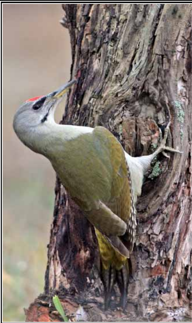
Grey-headed Woodpecker - M. Biasoli - November 2013